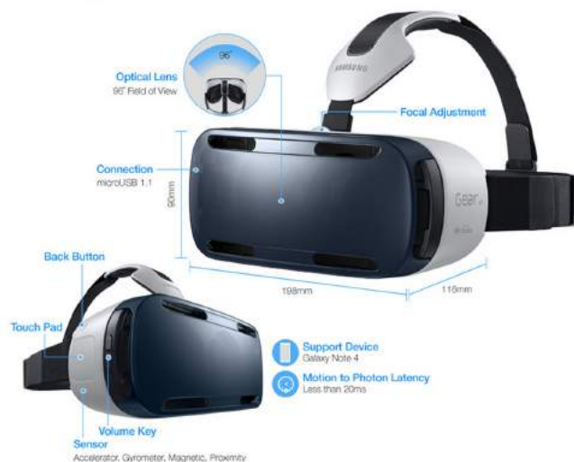
Figure 2. Key features of Samsung Gear VR [10]

Currently there are many other mobile HMDs in the market following the Google Cardboard idea. Simple and cheap wireless HMDs that work in combination with an android or iOS devices and use the stereoscopic display and the head tracking of the device. But Samsung had an idea of improving the wireless HMD experience that utilized mobile devices by introducing their own upgraded version building on top of the Cardboard idea. Samsung Gear VR is a wireless HMD developed by Oculus VR specifically for Samsung and their flagship phones, Galaxy Note 4 and Galaxy S6 devices.