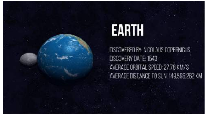
Figure 4. Earth's information page