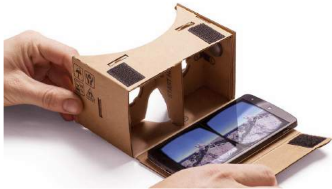
Figure 1. Google Cardboard [9]

However, one concern that arose was how the general public will adapt to VR HMD, the companies are developing integrated HMD, which requires the consumer to buy new hardware. Solution to this problem started another trend of VR which surfaced during early 2014, where instead of an unfamiliar technology, one would utilise the power of the smartphones currently used by the general public. This was first shown by Google with their Google Cardboard HMD as a joke during the Google developer conference, where a piece of cardboard with optical lenses and an android phone could display VR wirelessly with the Google Cardboard application. This opened the way for affordable wireless HMD that could be used for the mobile platform. This solution is however not without its flaws; one major concern regarding Google Cardboard is the fact that the head tracking is using the built-in accelerometer of phones, this caused lag and headaches/motion sickness for many users.