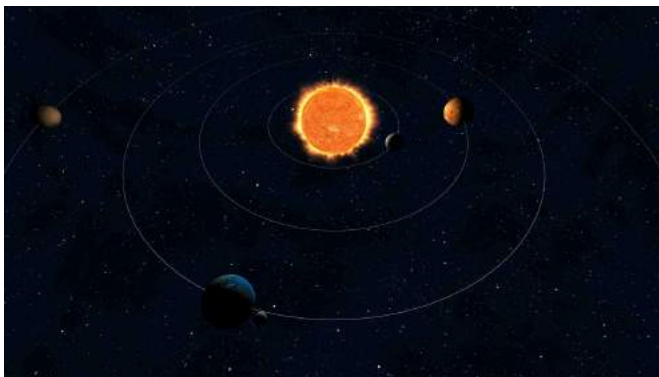
Figure 3. Main menu with the solar system

We developed two versions of a mobile educational application; the first one is specifically designed to work with an android smartphone while the second one designed to work in a VR environment with the help of Samsung Gear VR. They were developed using Unity3D which is a game engine used to develop games and applications for many different platforms. Our goal was to have identical features for both versions to avoid any bias and not to favour either.